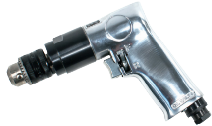
3/8" Reversible Air Drill PS-705