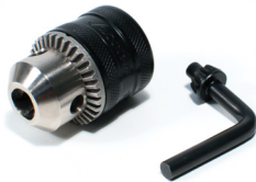
3/8"-24 Jacobs Chuck for Pneumatic Drills 10035