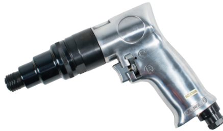
1/4" Air Screwdriver with Positive Clutch PT-1738