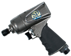
1/4" Impact Driver (Made In Japan) SP-8102B