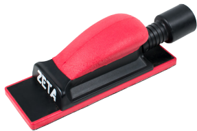
Vacuum Hand Sanding Block 5" - ZT10200 / 8" - ZT10210