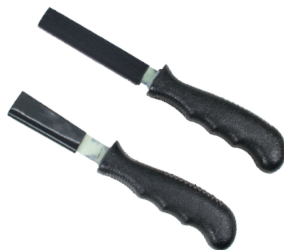
Hand Stick Sander 24mm - 1039624 27mm - 1039402