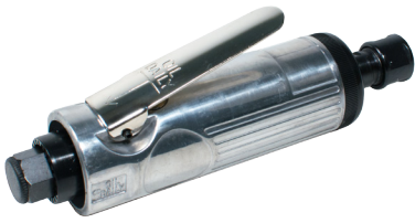
1/4" Mini Die Grinder T127A