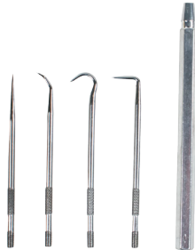
5pc Hook and Pick Set CL-519