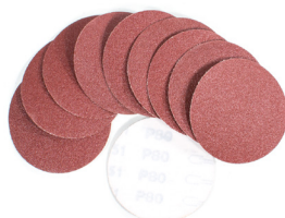
3" Hook and Loop Sandpaper SP03080