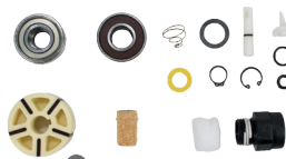
AirVANTAGE Overhaul Kit AVA0852