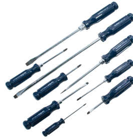
9pc Screwdriver Set DH-900