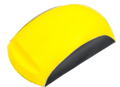
6" Hand Sanding Block PSA - 1470631 / Hook - 1470632