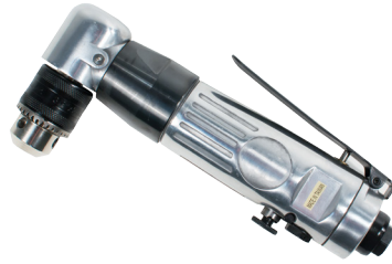
3/8" Right Angle Drill PT-1263