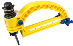
Multi-Angle Brick and Block Cutter TT-002