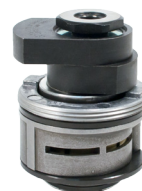
AirVANTAGE or VerTECH Sander Drop In Motor 3", 5" and 6" Available