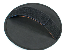
Hook and Loop Hand Pad 5" and 6" Available