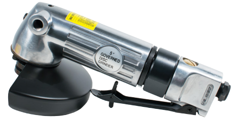
5" Angle Disc Grinder DG-50L3