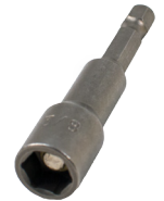
Magnetic Nut Driver