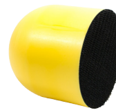
3" Palm Sanding Block 1371132