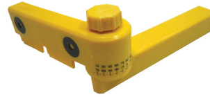
Hand Saw Mitre Gauge TT-003