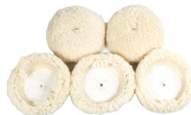
3" Wool Pads Q-BWP