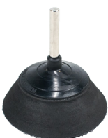
2" / 3" Eva Drill Pad EVA-2 / EVA-3