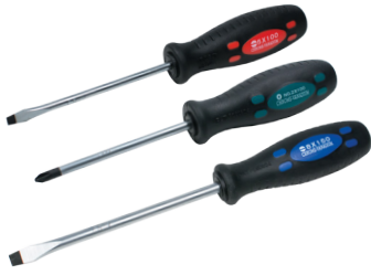
Magnetic Screwdriver NV:4902100PH / NV:4905100SL NV:4908150SL