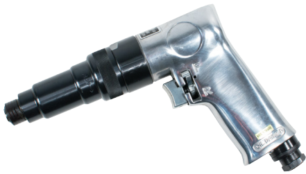
1/4" Air Screwdriver with Adjustable Clutch PS-802