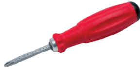
Gauge Screwdriver GS-001